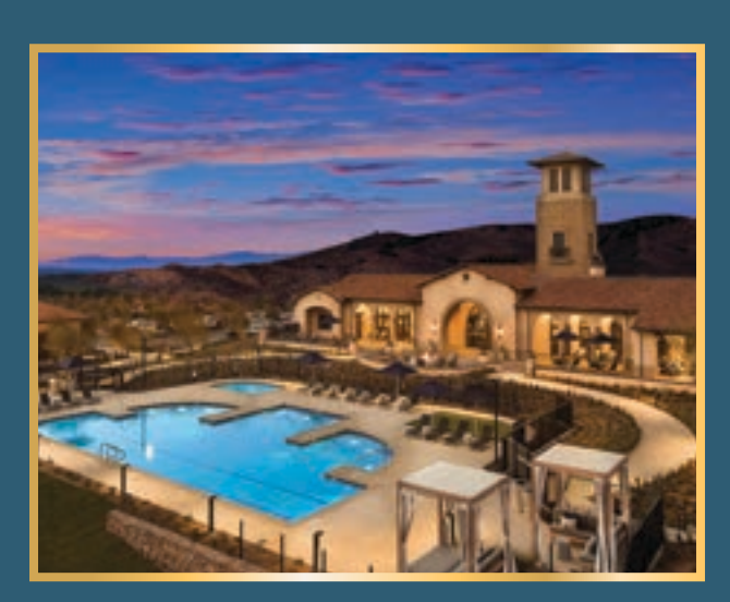
TERRAMOR - LOS ANGELES

In 2025 Starwood Land acquired 11 master-planned communities comprising more than 16,000 homesites and 600 acres of commercial property in three of the Top Ten largest U.S. new home markets – Dallas, Houston and Austin. In 2025, for the third consecutive year, Starwood Land's Sunterra in Houston is the #1 selling community in Texas.